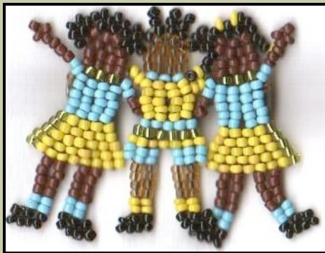
Price: £3.50 CODE B-3T

These are our “Rainbow Children”; Topsy’s signature product. Hand-in-hand these multicoloured Tots celebrate the cultural and ethnic diversity of our Rainbow Nation.